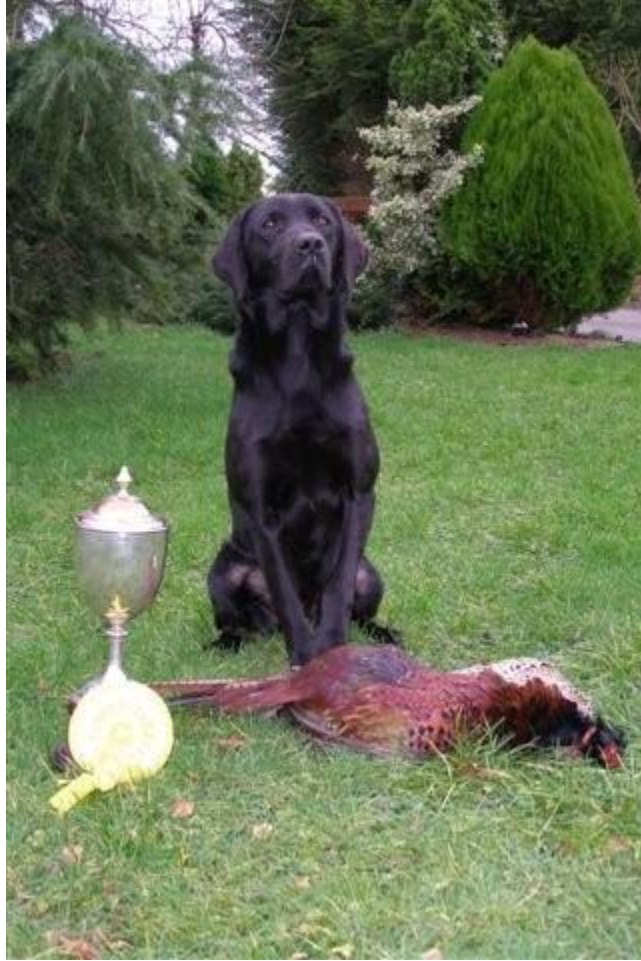
Ben in Northern Ireland